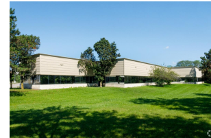
3885 Research Park Drive