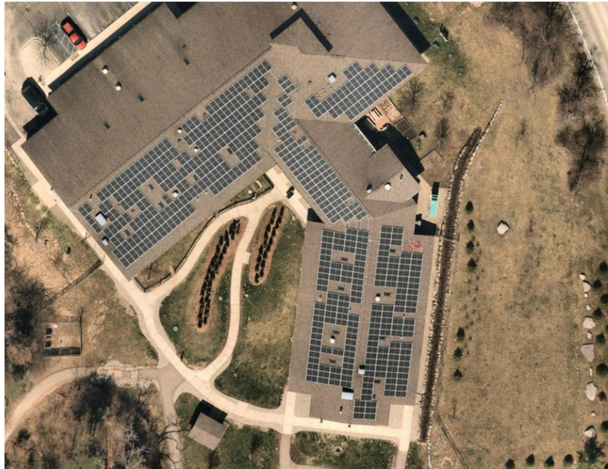
189.8kW DC roof mounted system